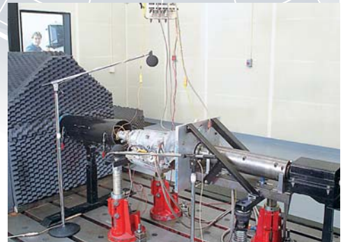
Specially designed fixtures simulate the engine mounting surface stiffness, allowing fast cost effective testing.