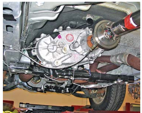
Roush offers full in-vehicle testing capability.