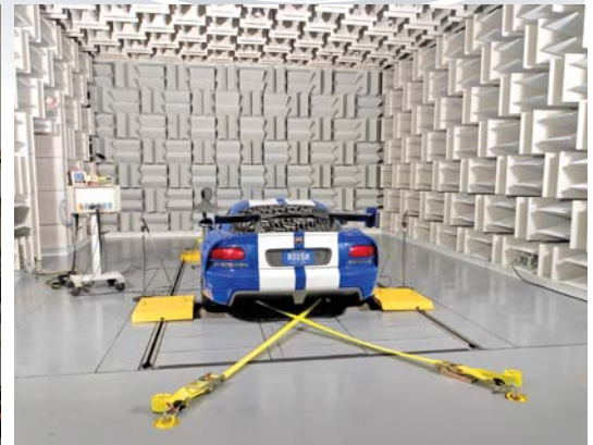
Roush Chassis Rolls